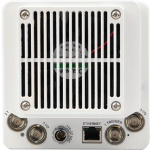
VEO S-model (Top), L-model (Bottom)