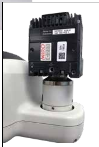
Miro C211 mounted to microscope