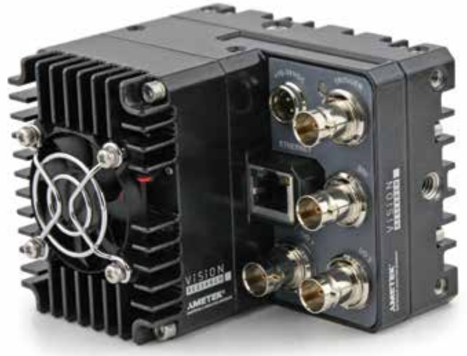
Miro C211 Connectors