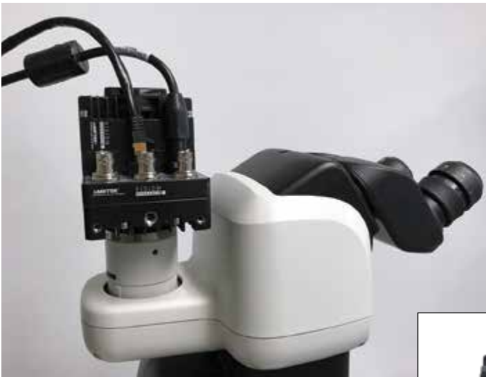
Miro C211 (connector view) mounted on a microscope